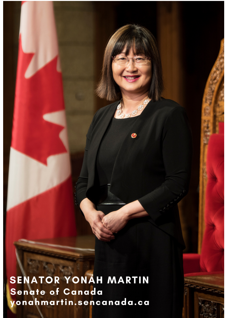
SENATOR YONAH MARTIN Senate of Canada yonahmartin.sencanada.ca

The Honourable Yonah Martin (born April 11, 1965) is a Conservative Senator from British Columbia, appointed by The Right Hon. Stephen Harper in 2009. She is the first Canadian of Korean descent to serve in the Senate of Canada and the first Korean-Canadian parliamentarian in Canadian history. Senator Martin is currently the Deputy Leader of the Opposition in the Senate (since November 2015). She previously served as the Deputy Leader of the Government in the Senate (2013-2015); and as the Deputy Whip of the Government (2011-2013). She has been Co-Chair of the Canada Korea Inter-Parliamentary Group since 2009; and Chairs or serves on the Executive of various intern-parliamentary groups. In November 2015, she co-founded International Parliamentary Coalition for Victims of Sexual Slavery (IPCVSS), and currently serves as Co-Chair of Canada. Her notable achievements as a Senator to date include the enactment of her Senate Public Bill - Korean War Veterans Day Act (June 2013); the successful campaign to add TCM and Acupuncturists to the schedule of health professionals for GST/HST exemption (April 2014); and the conclusion of a multi-year negotiation process and implementation of the historic Canada Korea FTA (January 2016).